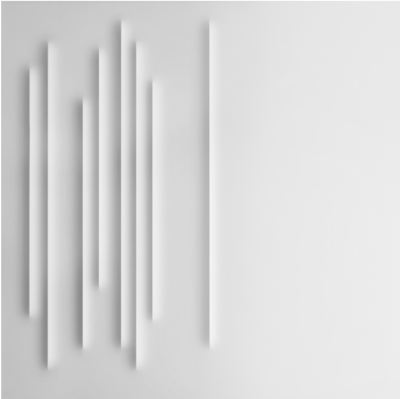
CCCCCLXXVI, Light Drawing 2018 Incised acrylic glass, white metal support 117 x 117 x 3,5 cm | 46.1 x 46.1 x 1.4 in