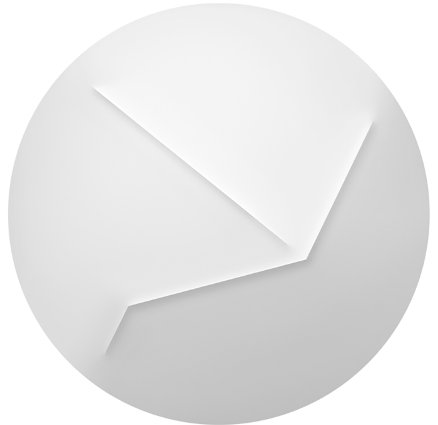
CCCCVI, Light Drawing 2014 Incised acrylic glass, white metal support Ø 98 x 4,5 cm | 38.6 x 1.7 in