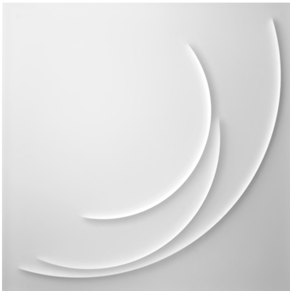
CCCCXXVII, Light Drawing 2015

Incised acrylic glass, white bristol support 50 x 50 x 2 cm | 19.7 x 19.7 x 0.8 in