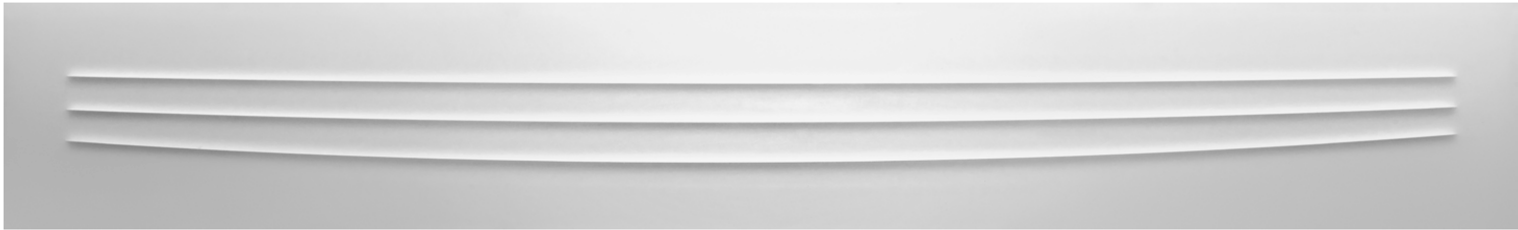
CLXIII, Light Drawing 2003 Incised acrylic glass, white metal support 45 x 298 x 3 cm | 17.7 x 117.3 x 1.2 in