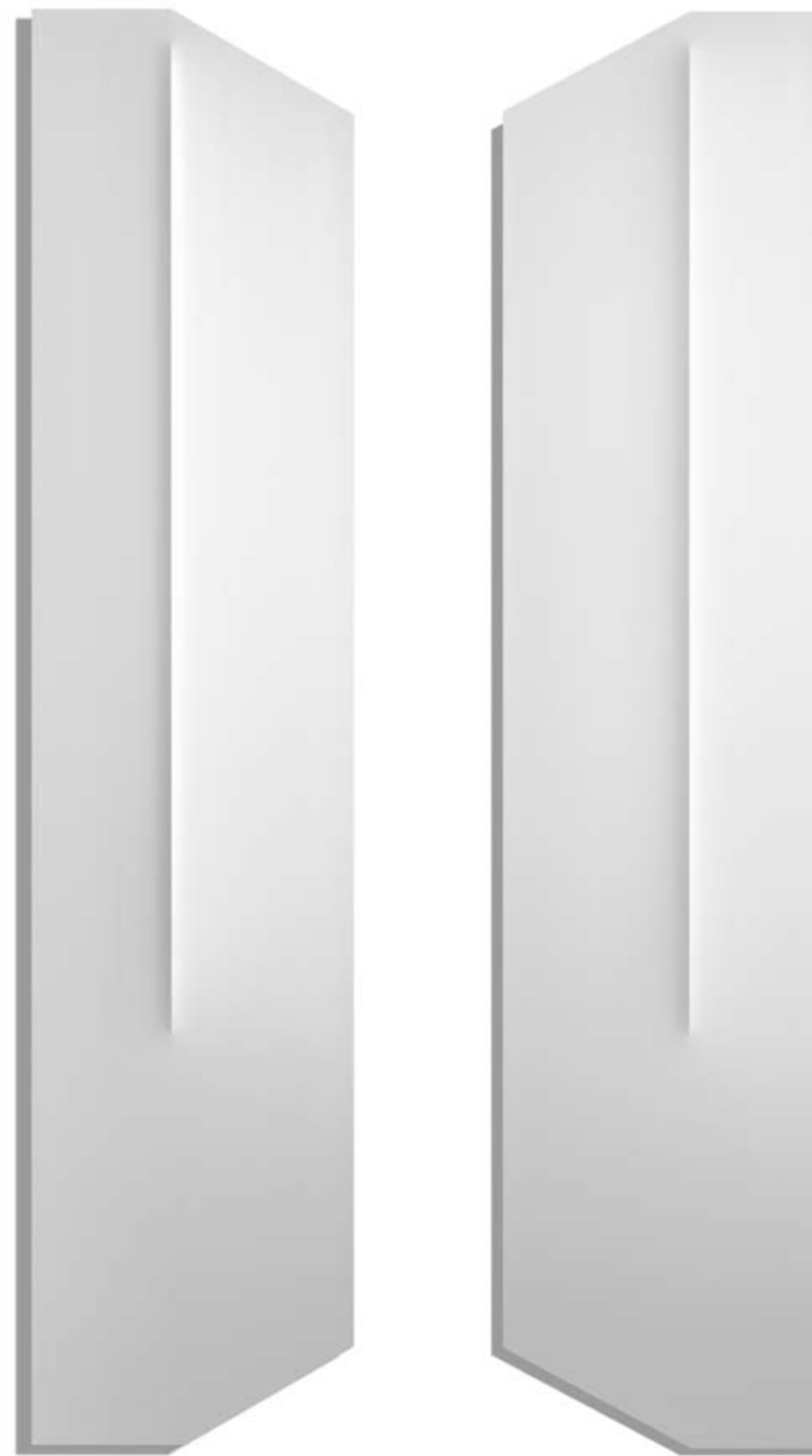
CCCCLXXXVI-CCCCLXXXVII, Light Drawing 2019

Incised acrylic glass, white metal support 100 x 100 x 3,5 cm | 39.4 x 39.4 x 1.4 in