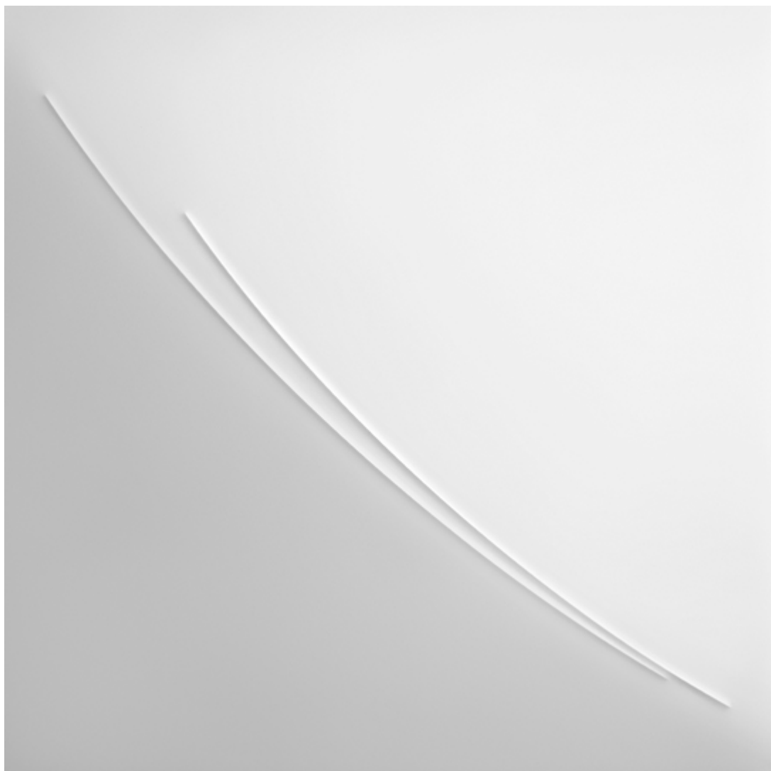
CCCCCLXXIX, Light Drawing 2018

Incised acrylic glass, white metal support 100 x 100 x 3,5 cm | 39.4 x 39.4 x 1.4 in