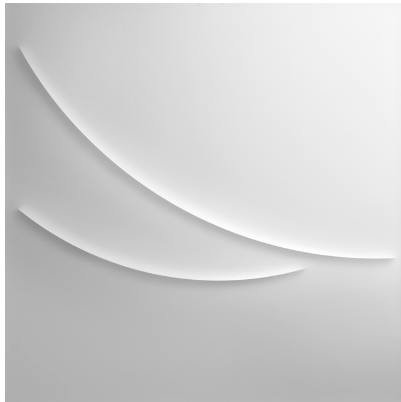
CCCCLXXXIII, Light Drawing 2018

Incised acrylic glass, white bristol support 50 x 50 x 2 cm | 19.7 x 19.7 x 0.8 in