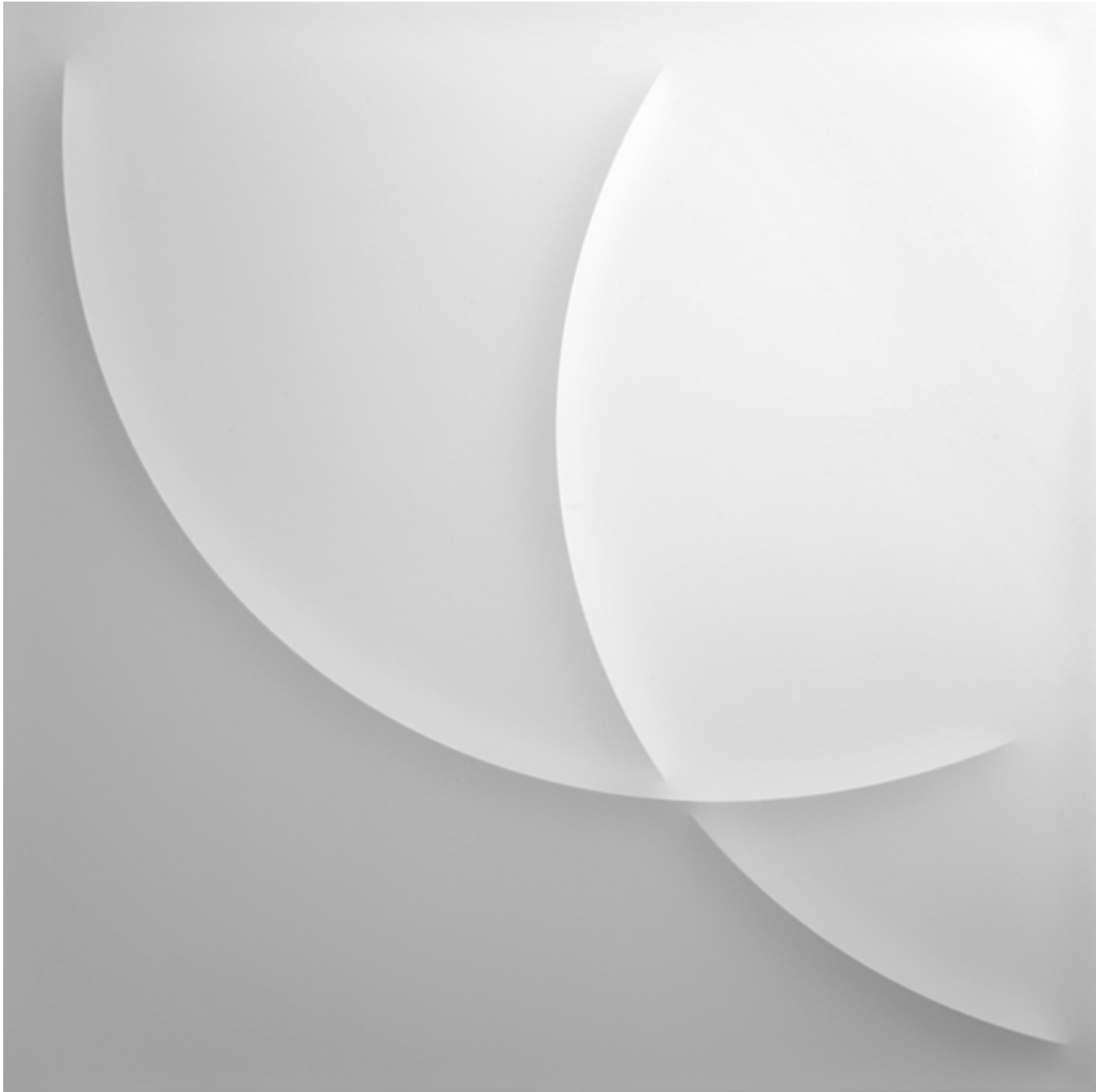
DXXXVIII, Light Drawing 2023

Incised acrylic glass, white metal support 50 x 50 x 3,5 cm | 19.7 x 19.7 x 1.4 in